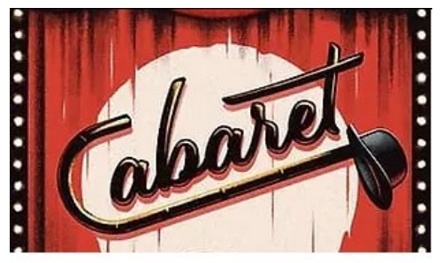
Cabaret: The Musical June 16th - July 2nd, 2023

The SpongeBob Musical <u>May 19th - June 4th, 2023</u>